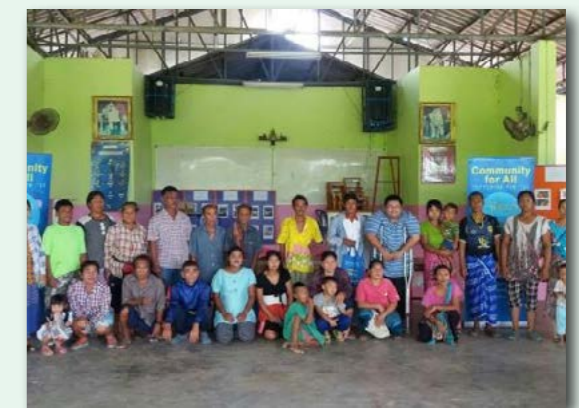
Photo: operations specialist shared with the interviewer about "Groups of people with disabilities";