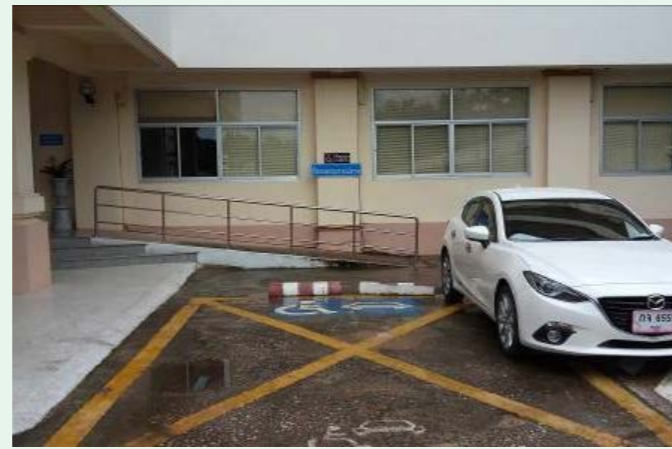
Car parking in Payao Province