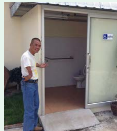
Toilet and sloping path in Si Ssa Ket Province