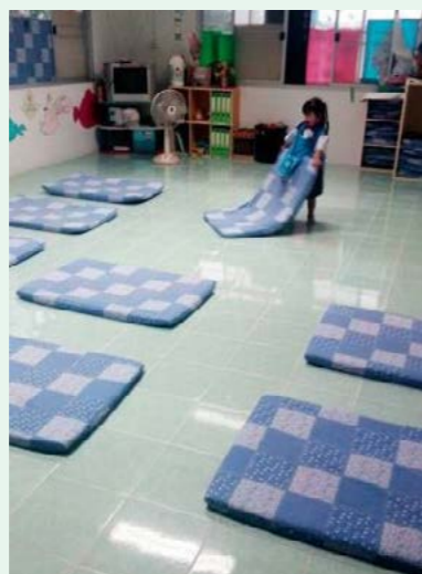
Nong Mey with teachers.