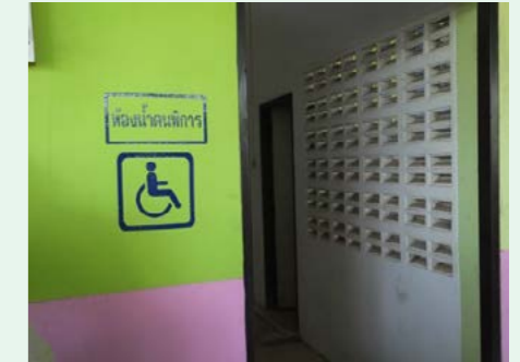
Toilet and sloping path in Kanchanaburi Province

Photo: Operations specialists shared the interviewers about their "Promoting for physical accessibility";