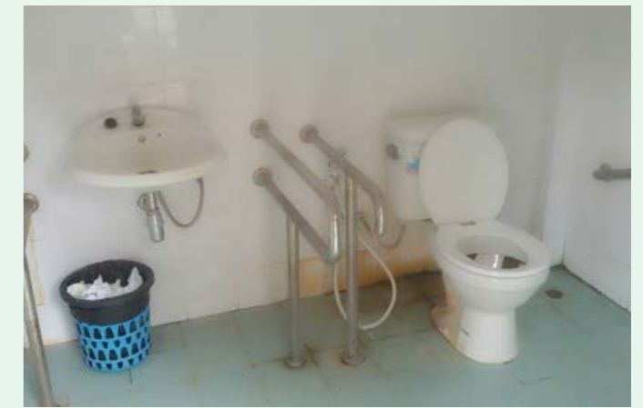
Parking, toilet and sloping path in Nakhon Si Thammarat Province