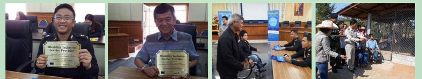
operations specialist shared with the interviewer about "Collaboration on chicken farming between persons with disabilities and local authorities";