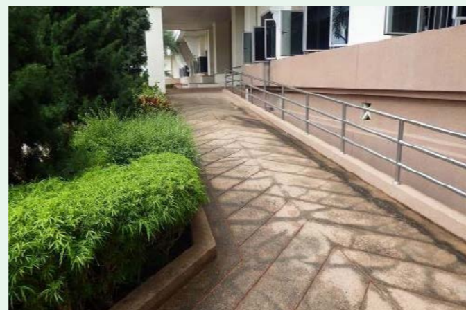
Toilet and sloping path in Payao Province