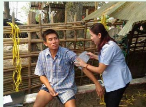
operations specialist shared with the interviewer about "Thawangthong rehabilitation center and home visit for persons with disabilities"