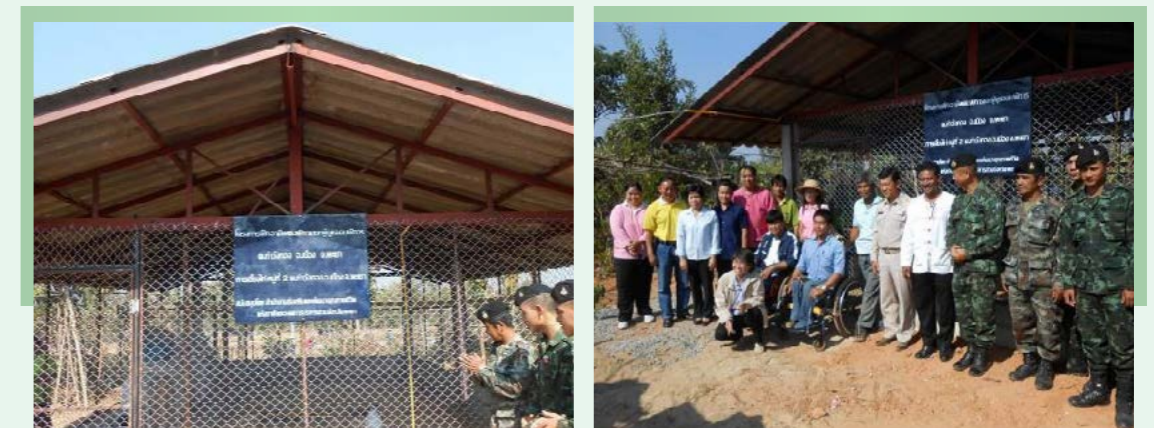
The chicken coop was built by the military. The chicken farming received financial support from the Payao Provincial Administrative Organization (PAO)

"Big thanks to local agencies who never forget nor leave out persons with disabilities, and truly include them in the society!"